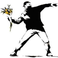
Society as change (above: Banksy)...

Department of Sociology and Social Work University of Wisconsin-Stevens Point